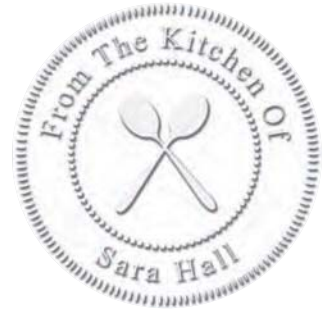
1 5/8" dia.