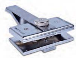
Elite Reversible 1" x 2" Die Holder