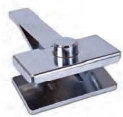
Elite One Way 1" x 2" Die Holder