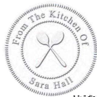
1 5/8" dia.