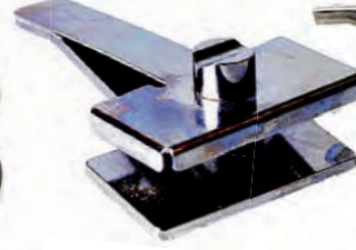
1" x 2" Die Holder