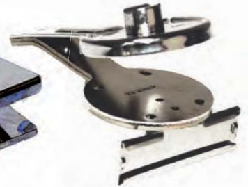
"Official" KO Die Holder with seal identification plate