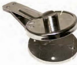
"Official" K Die Holder

*The "Official" K and KO Frame Seals can use either K or KO Die Holders.