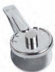
Elite 1 5/8 Die Holder

*The Standard Elite Die Holder will NOT work with the Economy Elite Frame.