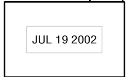
1-1/8" x 2" 28mm x 51mm