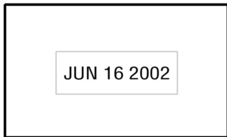
1-3/8" x 2-5/16" 33mm x 59mm