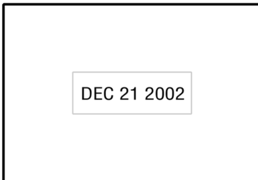
1-7/8" x 2"-3/4" 49mm x 69mm